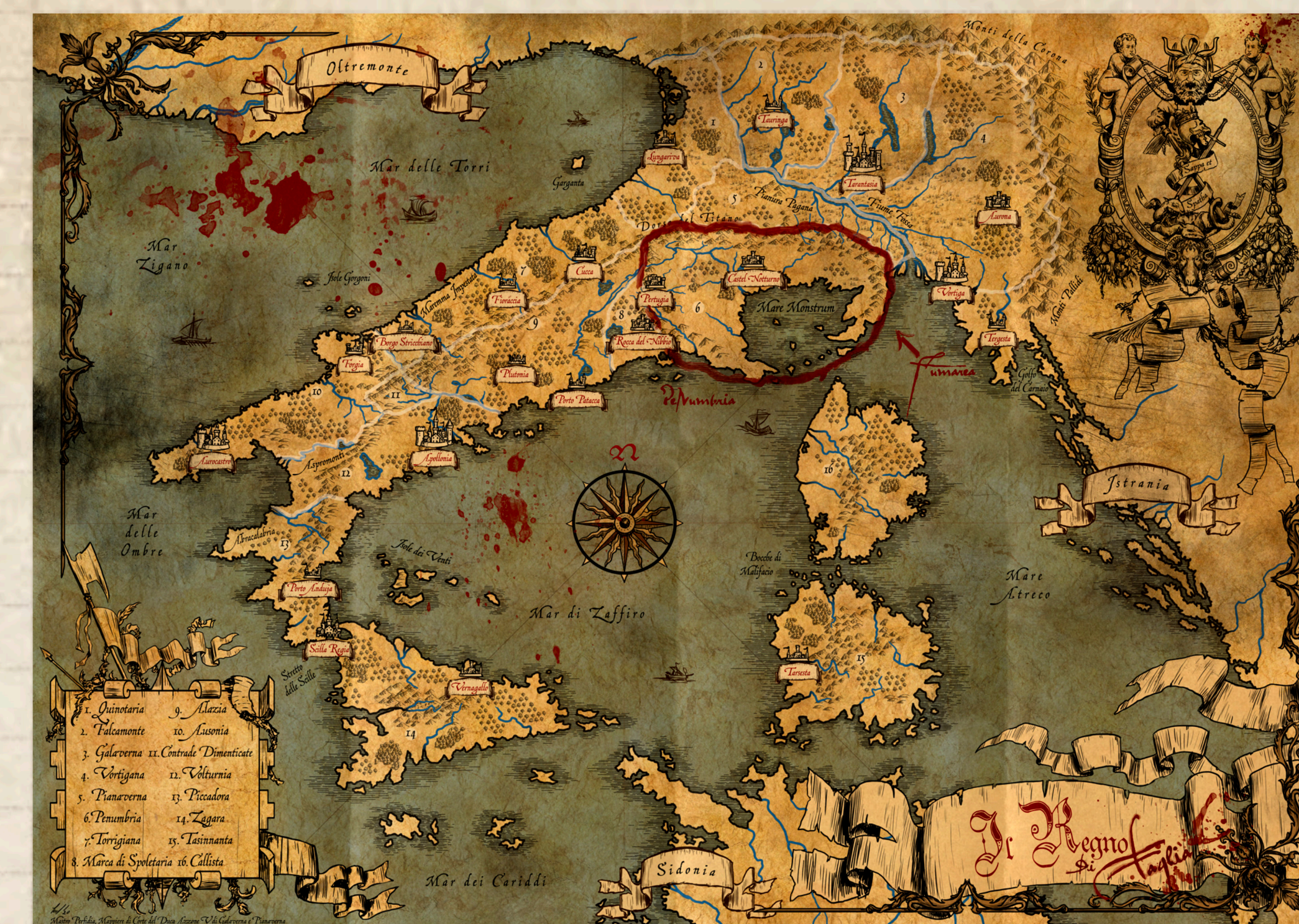
MAP OF "IL REGNO DI TAGLIA" (THE KINGDOM)

Brancalonia stands at the intersection of numerous Italian cultural texts: among the others, the films of Monicelli; those of Bud Spencer and Terence Hill; the masterpieces of Italo Calvino, Carlo Collodi, Dante Alighieri and other Italian authors; popular and cultural images repertoires, including advertising. It is possible to read Brancalonia as a literary text devoted to intentionally spreading italian culture through the skilful manipulation of metatextual and peritextual elements and specific game mechanics . Traditional elements from the italian canon are introduced to make the game more attractive internationally.